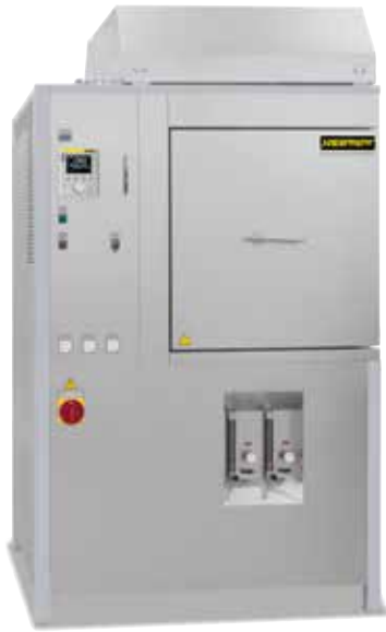
High-temperature furnace HT 160/17 with gas supply system