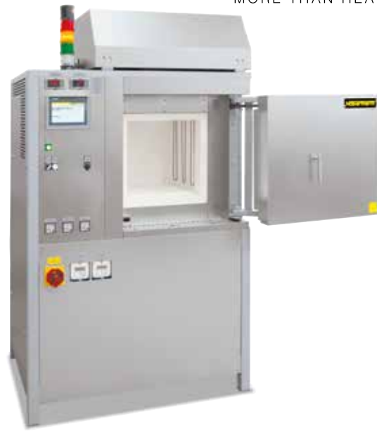
High-temperature furnace HT 64/17 DB100-2 with safety package for debinding