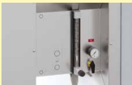
Automatic gas supply system with solenoid valve and rotameter