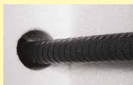
Furnace chamber with high-quality fiber materials and SiC heating rods on both sides of the furnace