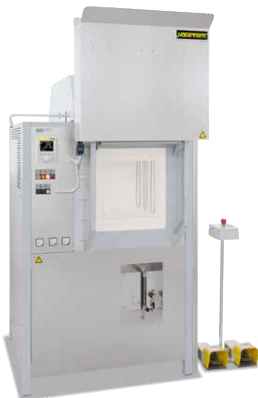
High-temperature furnace HT 64/16S with lift door