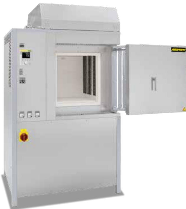
High-temperature furnace HTC 160/16

The high-temperature furnaces HTC 16/16 - HTC 450/16 are heated by vertically hung SiC rods, which makes them especially suitable for sintering processes up to a maximum operating temperature of 1550 °C. For some processes, e.g. for sintering zirconium oxide, the absence of interactivity between the charge and the SiC rods, these models are more suitable than the alternatives heated with molybdenum disilicide elements. The basic construction of these furnaces make them comparable with the already familiar models in the HT product line and they can be upgraded with the same additional equipment.