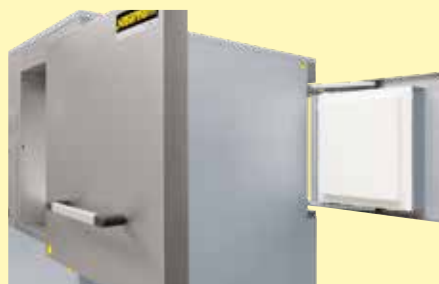
Two-door design for high-temperature furnaces > HT 276/..