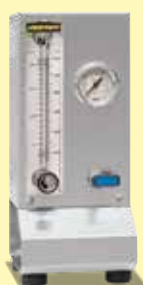
Gas supply system for non-flammable protective or reactive gas