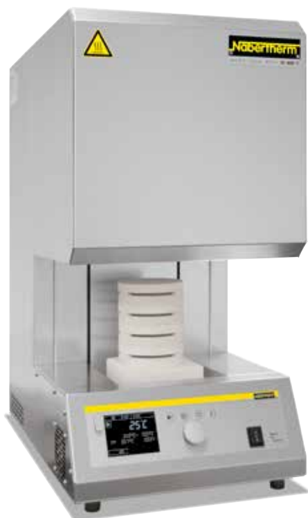
High-temperature furnace LHT 02/17 LB Speed with a set of saggars

The motor-driven lifting table significantly simplifies the charging of the high-temperature furnaces LHT ../. LB (Speed). The heating all around the cylindrical furnace chamber provides for an optimal temperature uniformity. For the tabletop models LHT 01/17 LB Speed and LHT 02/17 LB Speed the charge can be placed in charge saggars made of technical ceramics. Up to three charge saggars can be stacked on top of each other resulting in a high productivity.