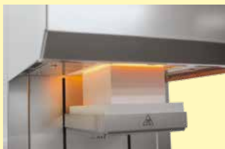
Electrically driven lift-bottom

*Please see page 75 for more information about supply voltage