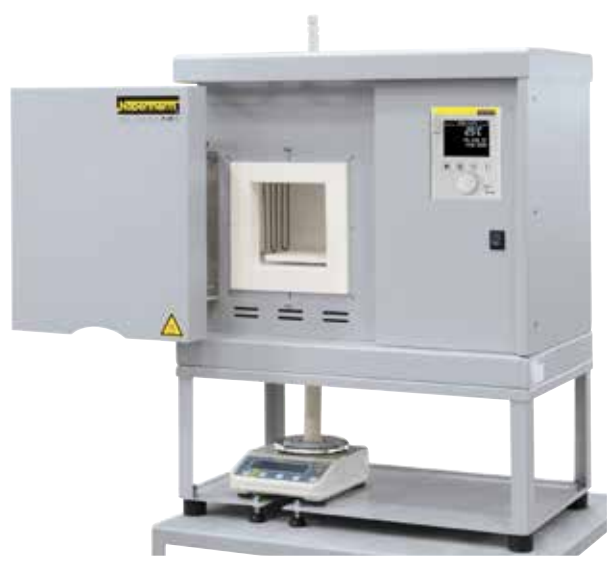
High-temperature furnace LHT 04/16 SW with scale for measuring weight reduction during annealing

These high-temperature furnaces were specially developed to determine combustion loss during annealing and for thermogravimetric analysis (TGA) in the lab. The complete system consists of the high-temperature furnace for 1600 °C or 1750 °C, a table frame, precision scale with feedthroughs into the furnace and powerful software for recording both the temperature curve and the weight loss over time.