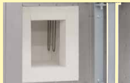
Light-weight refractory bricks and heating elements made from molybdenum disilicide