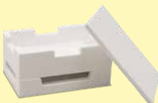
Saggars with top lid