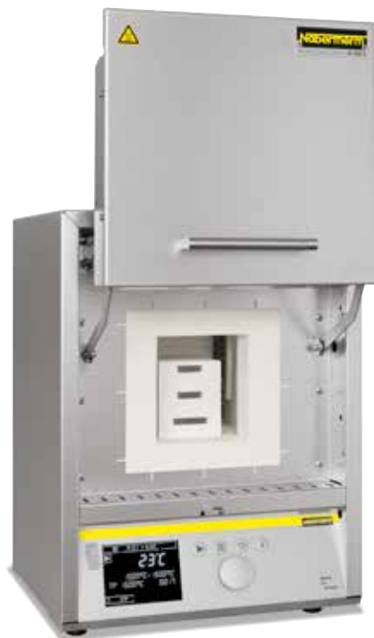
High-temperature furnace LHTCT 01/16

These powerful laboratory muffle furnaces are available for temperatures up to 1400 °C, 1500 °C, 1550 °C or 1600 °C. The durability of the SiC rods in periodic use, in combination with their high heating speed, make these high-temperature furnaces to all-rounders in the laboratory. Heating times of 20 - 25 minutes to 1400 °C can be achieved, depending on the furnace model and the conditions of use.