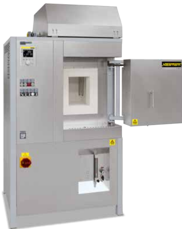
High-temperature furnace HFL 16/17 DB50

The high-temperature furnaces HFL 16/16 HFL 160/17 are characterized by their lining with robust light refractory bricks. This version is recommended for processes producing aggressive gases or acids, such as under glass melting.