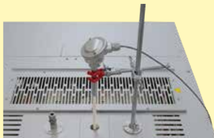
Thermocouple port in the ceiling with tripod