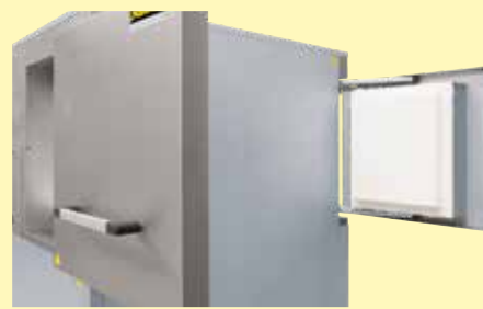
Two-door design for high-temperature furnaces > HT 276/..