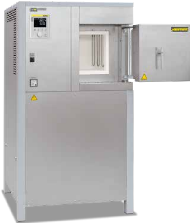
High-temperature furnace HT 16/17

Due to their solid construction and compact stand-alone design, these high-temperature furnaces are perfect for processes in the laboratory where the highest precision is needed. Outstanding temperature uniformity and practical details set very high quality benchmarks. For configuration for your processes, these furnaces can be extended with extras from our extensive option list.