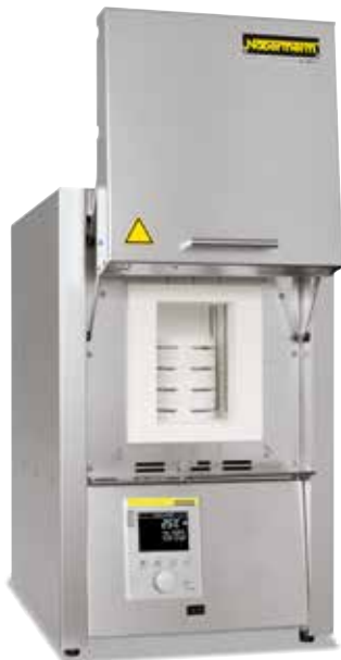
High-temperature furnace LHT 03/17 D

Designed as tabletop models, these compact high-temperature furnaces have a variety of advantages. The first-class workmanship using high-quality materials, combined with ease of operation, make these furnaces all-rounders in research and the laboratory. These high-temperature furnaces are also perfectly suited for the sintering of technical ceramics, such as zirconium oxide dental bridges.