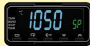
Example of an over-temperature limiter