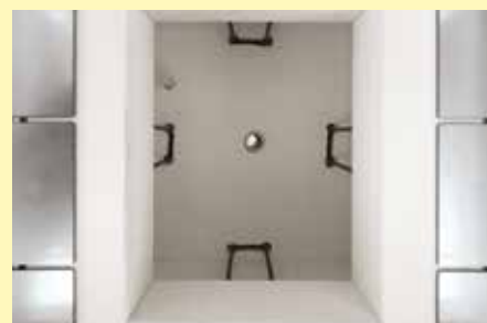
Furnace chamber heated on four sides for model LHT 01/17 LB Speed