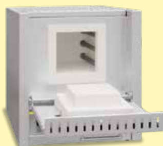
High-temperature furnace LHTC 08/16