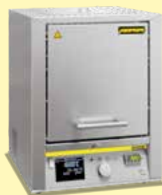
High-temperature furnace LHT 01/17 D