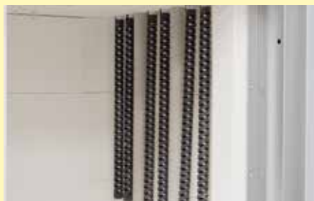
Vertically mounted SiC rods and optional perforated air inlet tubes of the debinding system in a high-temperature furnace