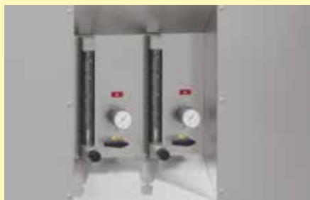
Automatic gas supply system