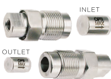
225µL Head Systems