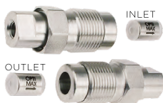
100µL Head Systems