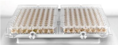
1 2 plate standard platform

Note! When using MPP4 platform do not set speed higher than 800 rpm.