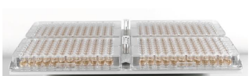
2 4 plate option MPP4